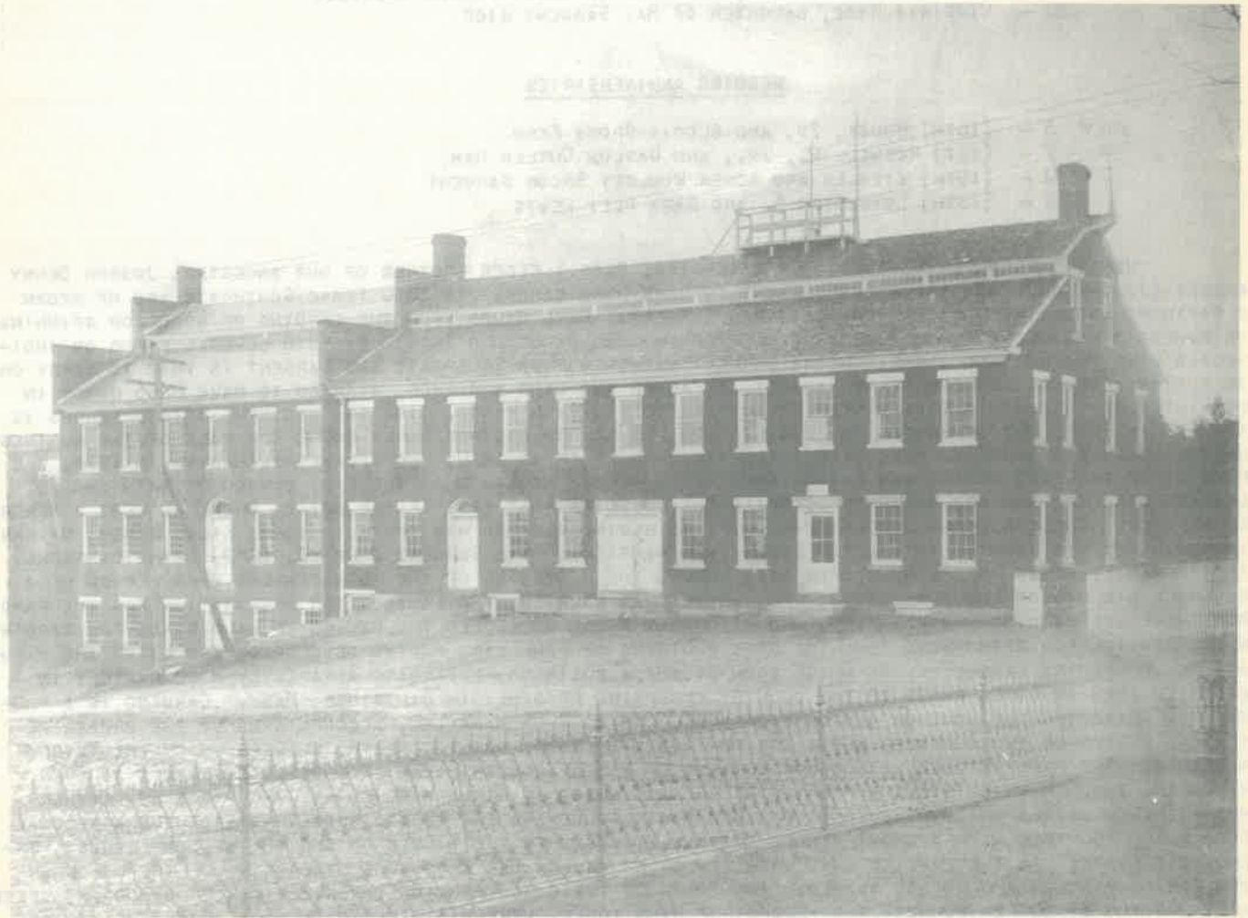
SHOPS OF SARGENT & BROTHER, LEICESTER, MASS.