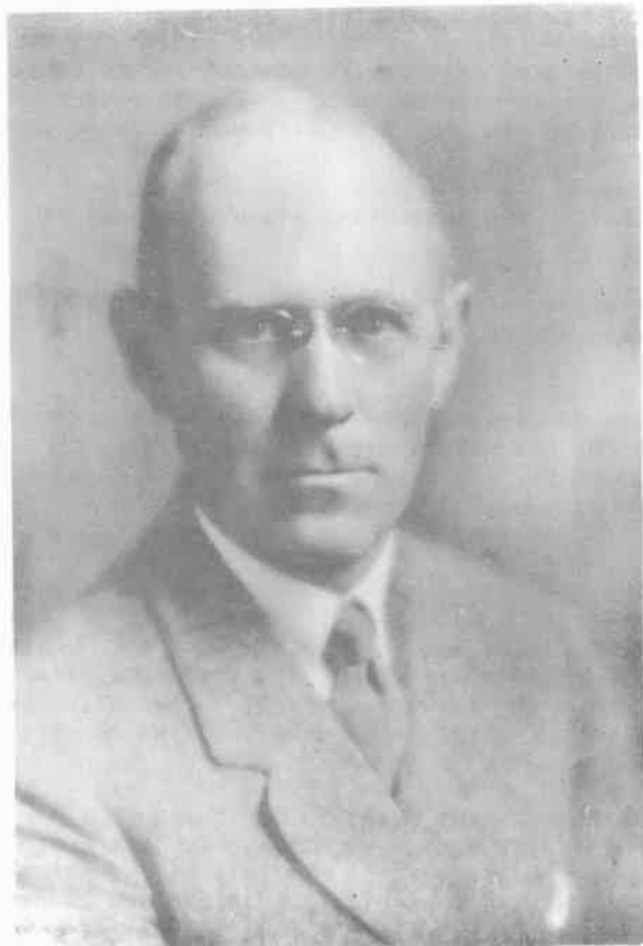
RUPERT SARGENT HOLLAND